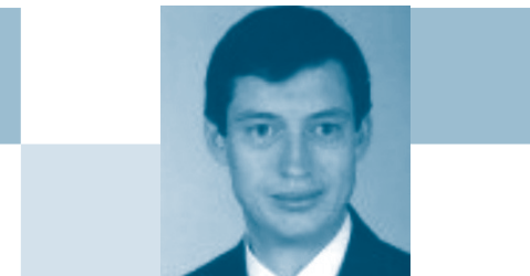
TPC CHAIR EUROCON.CONFTELE 2011

Instituto de Telecomunicações/Instituto Superior Técnico Portugal